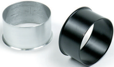
Shown approx. 45% actual size.