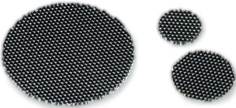
Shown approx. 30% actual size.