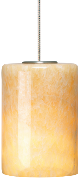
Shown approximately 25% actual size.