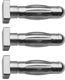
Shown approx. 125% actual size.