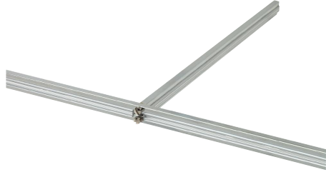
Shown approx. 10% actual size.