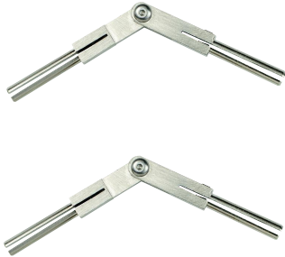
Shown approximately 50% actual size.