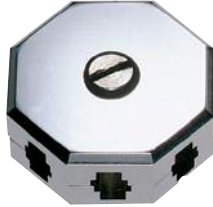
Shown approx. 50% actual size.