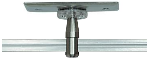
Shown approx. 35% actual size.