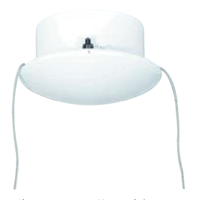
Shown approx. 15% actual size.