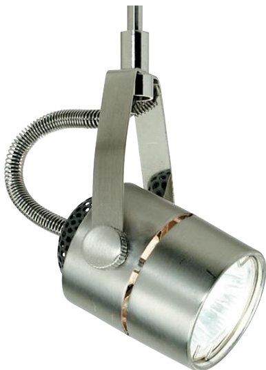
SPOT MR16 Shown approximately 50% actual size.