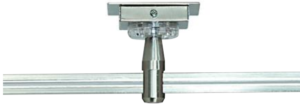
Shown approx. 30% actual size.