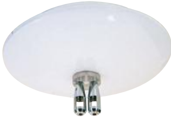
Shown approx. 20% actual size.