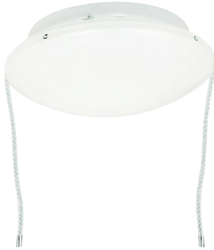
Shown approx. 20% actual size.