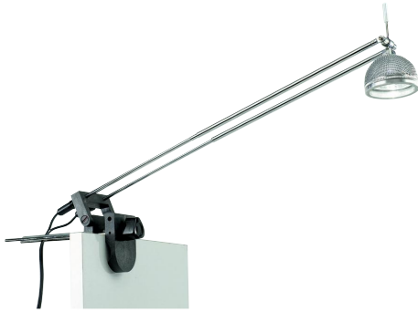
Shown approx. 10% actual size. (with Mesh Backlight Shield Accessory)