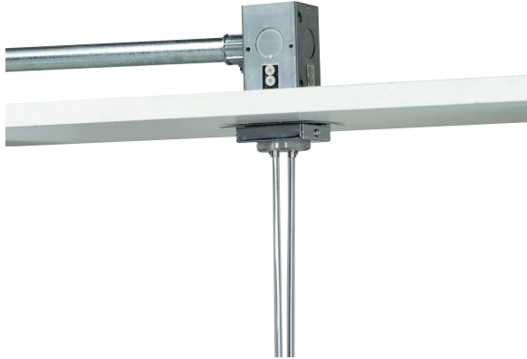
Shown approx. 20% actual size.