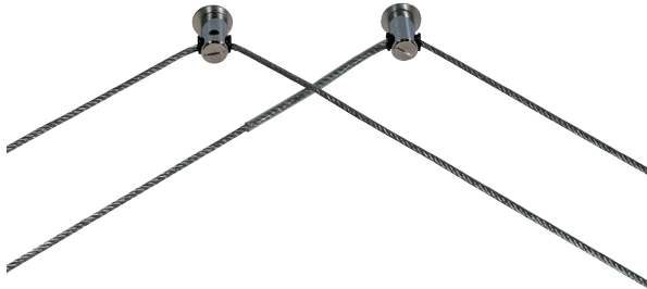
Shown approx. 25% actual size.