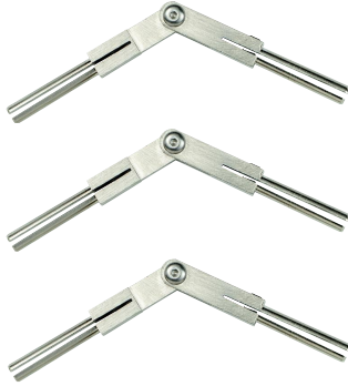
Shown approx. 40% actual size.