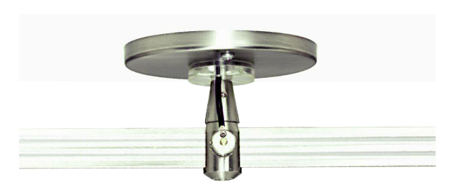
Shown approx. 35% actual size.