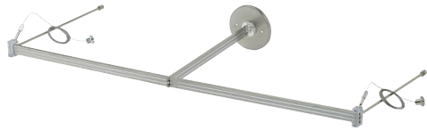
Shown approx. 5% actual size.