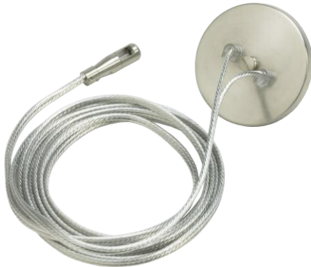
SINGLE-FEED Shown approx. 15% actual size.