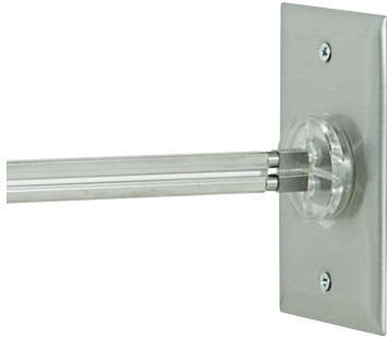
Shown approx. 35% actual size.