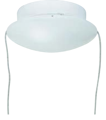
Shown approx. 20% actual size.