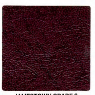
JAMESTOWN GRADE 2 OXBLOOD