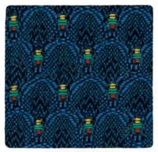
ESSEX GRADE 3 NAVY