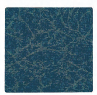
RENAISSANCE GRADE 4 STEEL BLUE