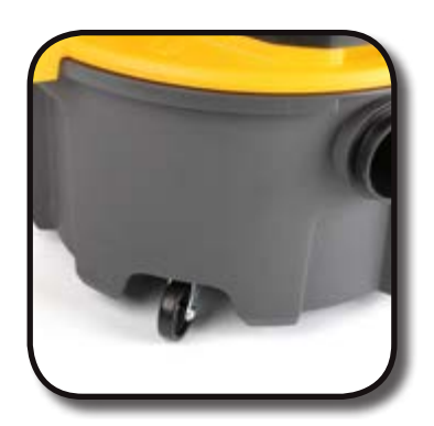
Tough, copolymer drum resists dents and cracks, will not rust.

Casters Swivel 360° For Maximum Mobility