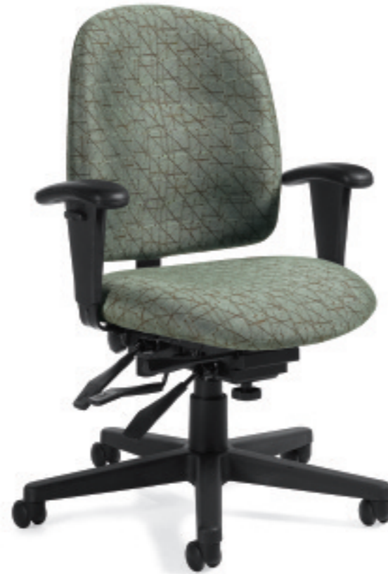
3212 Low Back Multi-Tilter with height adjustable "T" arms (3N), shown in Mayer, Jumpin Jacks (LC850-023)