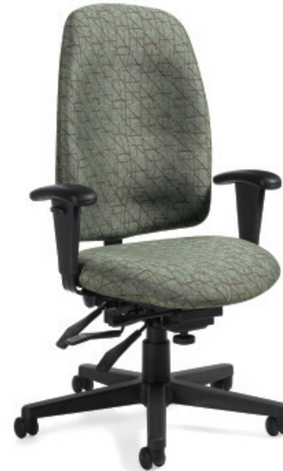
3217 High Back Multi-Tilter shown in Mayer, Jumpin Jacks (LC850-023)