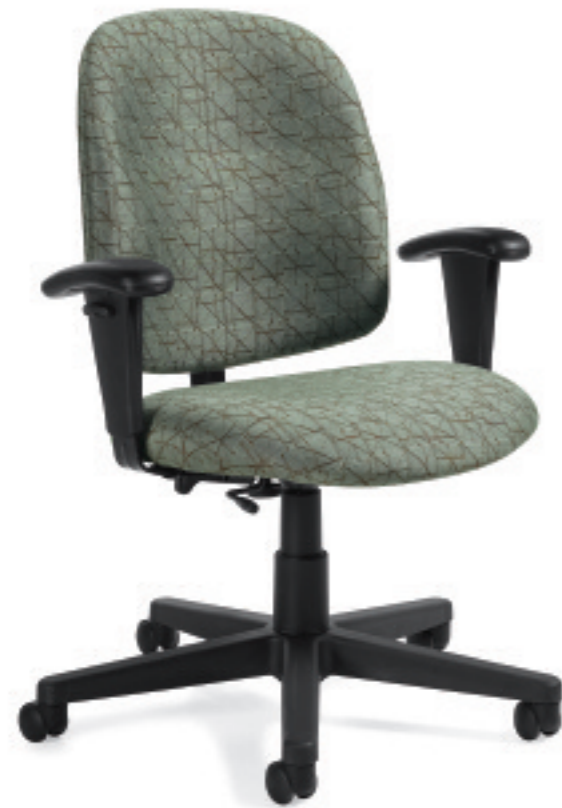
3255 Low Back Task with height adjustable "T" arms, shown in Mayer, Jumpin Jacks (LC850-023)

Granada... 23 different models to suit every office and ergonomic requirement.