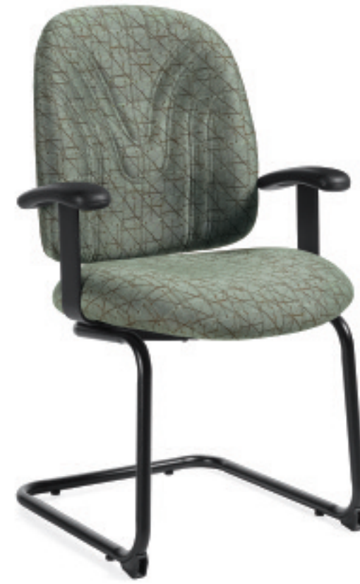
3262 Low Back Armchair with detailed back, shown in Mayer, Jumpin Jacks (LC850-023)