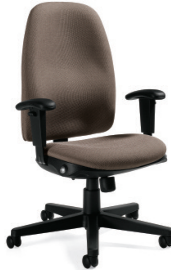
3105-1 High Back Synchro-Tilter shown in Labbers (LD11)