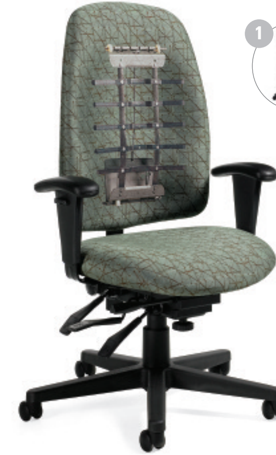
Above photo shows the concealed depth adjustable lumbar support incorporated into the back of select Granada models.