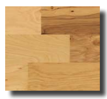
color | 32 honey spice