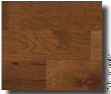
color 875 burnt amber