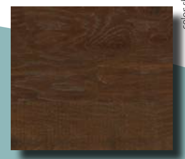
color 936 barnwood