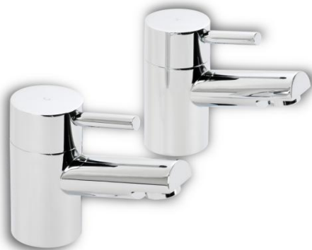
ILLUSTRATION: Dalton Basin Taps