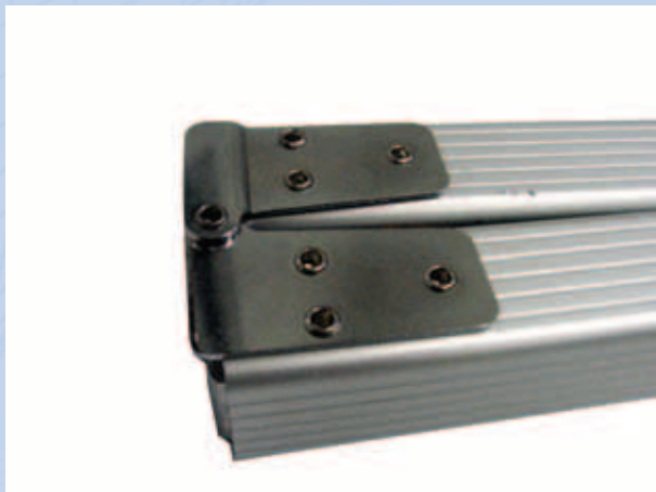
Patented aluminum frame connections ensure structural integrity with constant use.