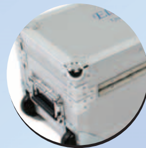
Strong Corner-Guard provides additional protection during transport and storage