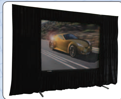
QuickStand Folding Screen 100" (Q100VD) shown with Standard Drape Kit