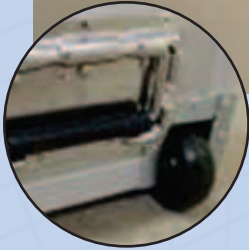
Light weight and durable aluminum traveling case is wheeled for easy transport, storage and shipping