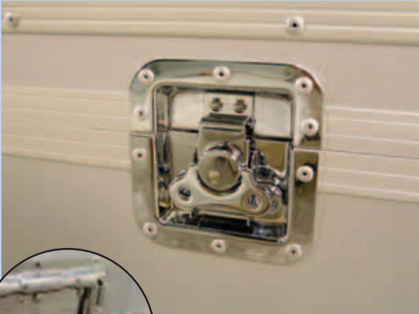
Locking mechanism on the metal storage case ensures safety during the storage and shipping