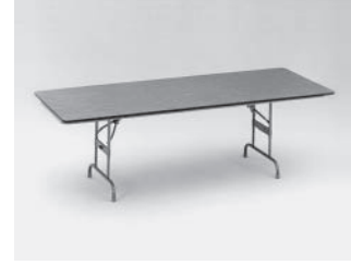
Heritage™ Adjustable Leg