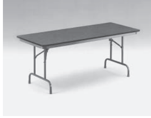
Heritage™ Fixed Leg