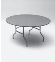
Premier® Round Table