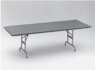
Premier® Adjustable Height Table