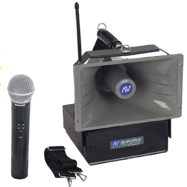
SW615A WIRELESS HALF-MILE HAILER WITH HANDHELD MIC