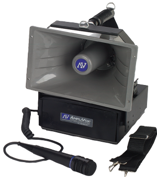
S610A HALF-MILE HAILER

The Half-Mile Hailer series helps schools meet the security requirements of the No Child Left Behind Act, which mandates schools to offer secure, safe learning environments for their students.