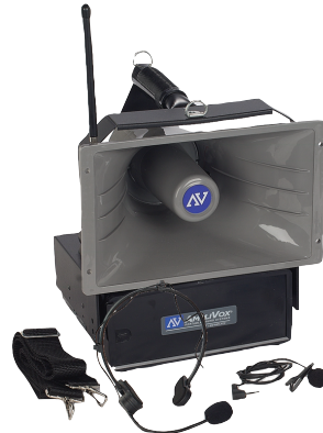
SW610A WIRELESS HALF-MILE HAILER