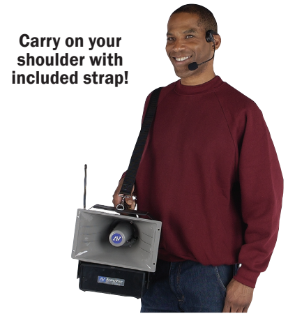
Carry on your shoulder with included strap!

HALF-MILE HAILER Outdoor portable horn; S805A 50-watt multimedia stereo amplifier with built-in tripod mount; S2080 dynamic handheld microphone with 5-ft. coil cord and adjustable shoulder strap.