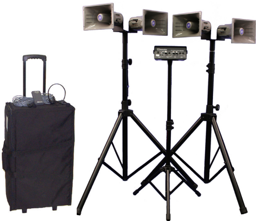
SW660 ADJUSTABLE COMPACT TRIPODS 28-49 INCHES! HEAVY GAUGE STEEL