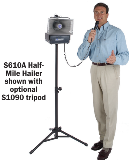
S610A Half-Mile Hailer shown with optional S1090 tripod