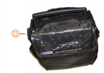
Built in storage compartment