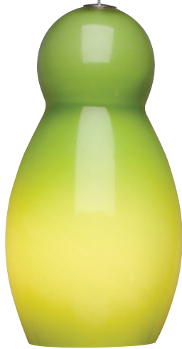
Granny Apple Green