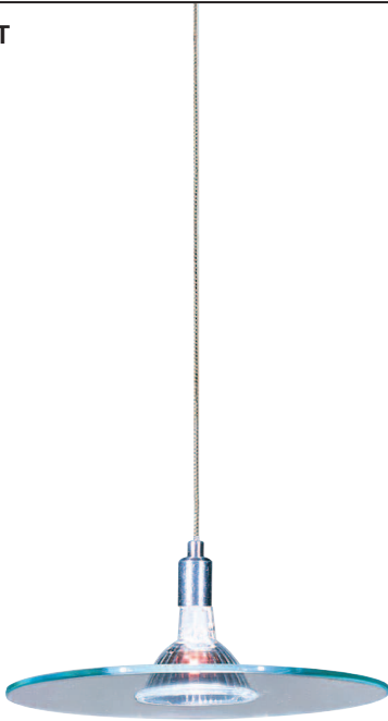
Shown approximately 30% actual size.