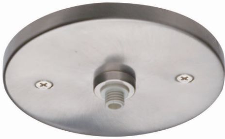
Shown approximately 50% actual size.