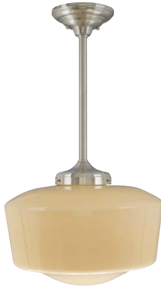
LATTE, FIXED-LENGTH Shown approximately 15% actual size.