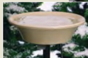
Pole Mount Included