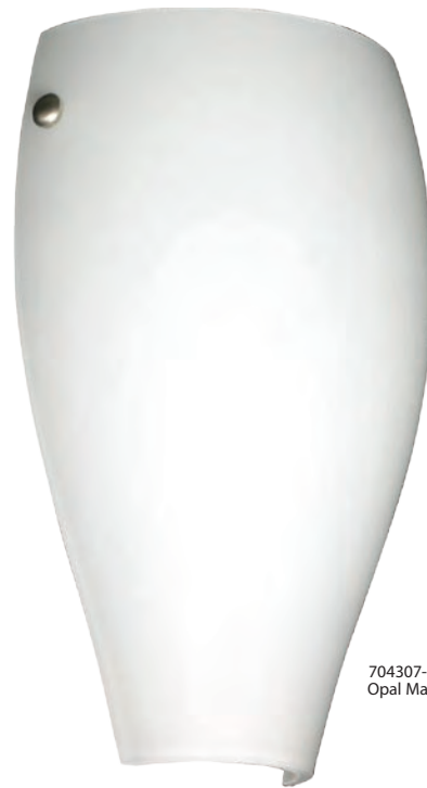
704307-SN Opal Matte

UL or ETL Listed. Suitable for Damp Locations (interior use only).