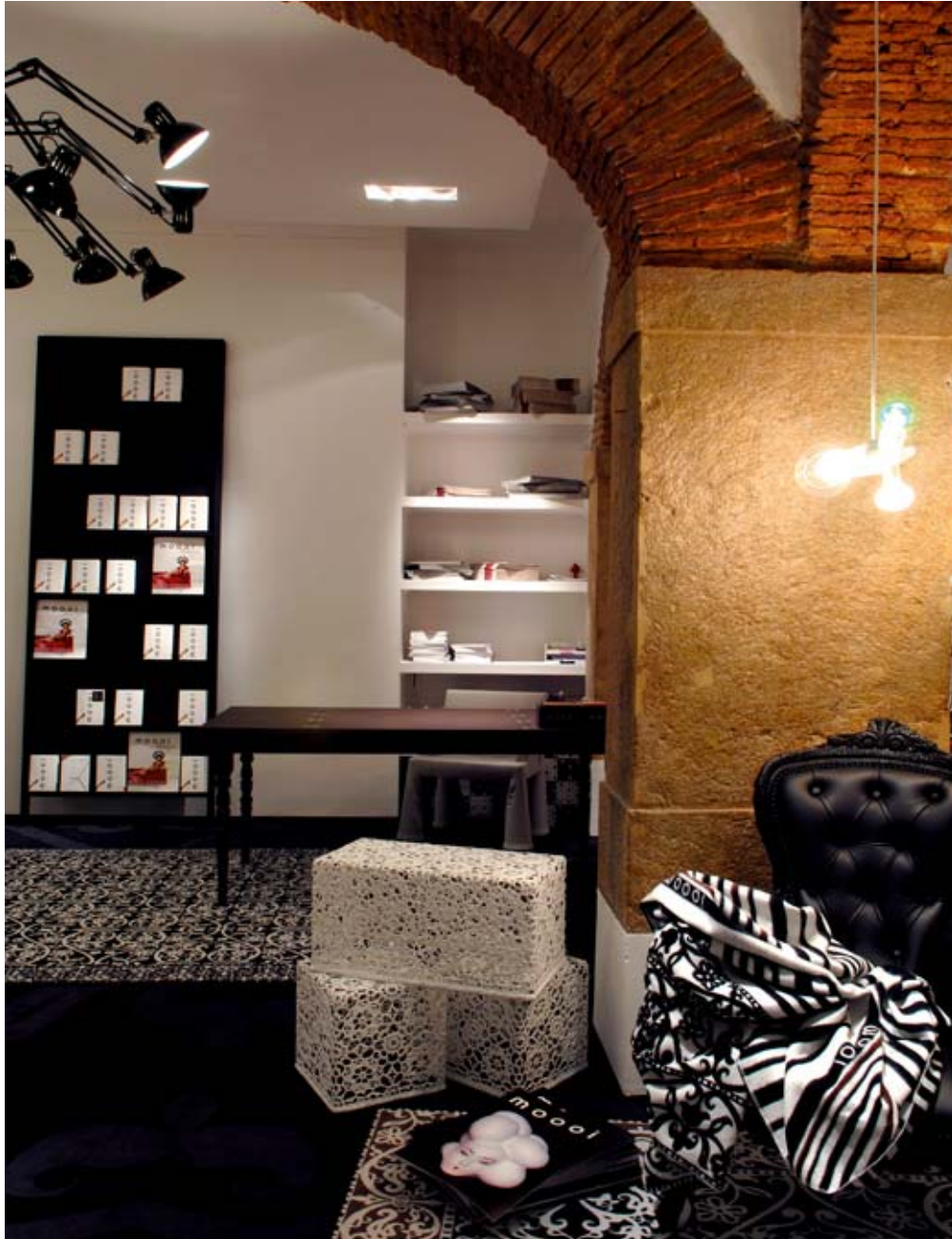
Moooi Monobrand store, Lissabon.