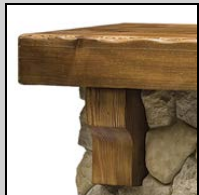
Hand-hewn pine mantel

Capture the feel of a private retreat! This simply stunning new mantel recreates the rustic charm of a woodland retreat with the life-like look of natural stone and hand-hewn pine.