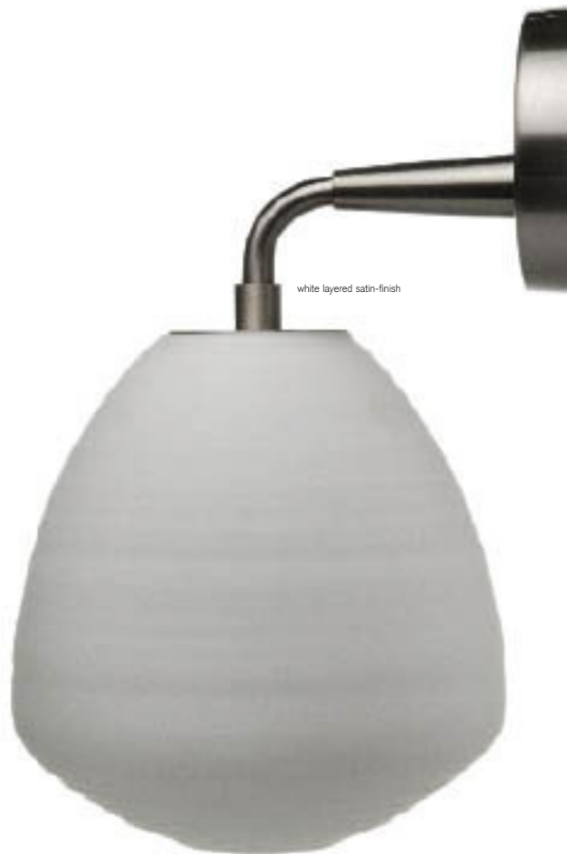
white layered satin-finish