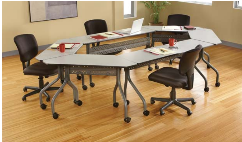
48" Gray Trapezoid and 18"x72" Mobile Training Tables in possible configuration