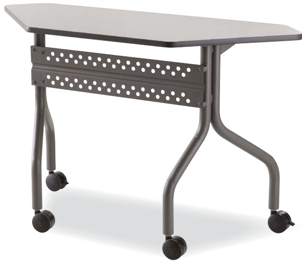
48" Trapezoid Mobile Training Table, Gray