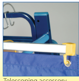
Telescoping accessory hooks for pocket charts