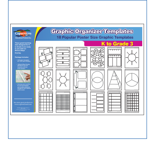
Graphic Organizer Templates AC4041 (K-Gr.3) & AC4043 (Gr.4-8)