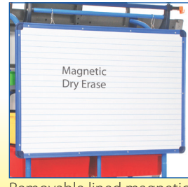
Removable lined magnetic dry erase board (AC455)