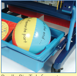
Really Big Tub for extra storage