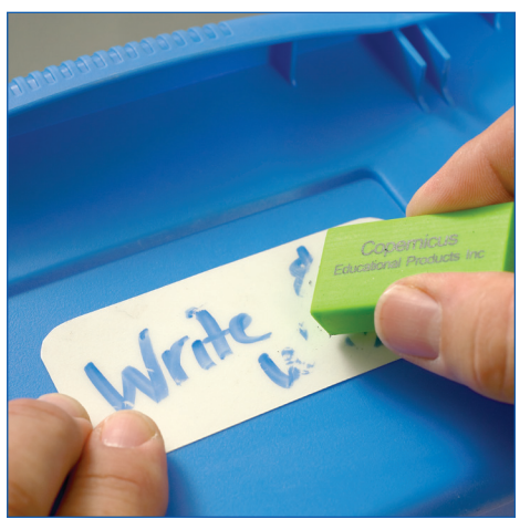
Re-Write Labels AC403 (pkg. of 48/3 sizes)