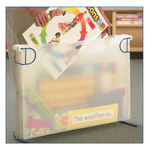
XL Poster File - Floor Caddy XLP-F