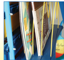
Storage for Big Books