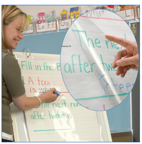
Write & Wipe Overlay