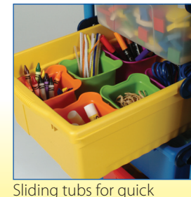
access to supplies