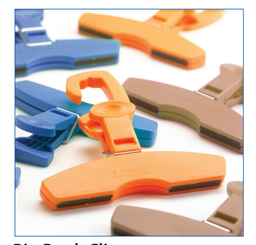
Big Book Clip AC401 (Pkg. of 6)