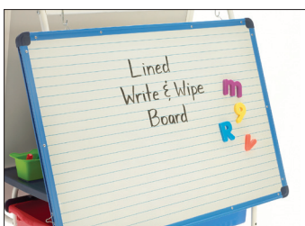
Rear removable and adjustable dry erase board (lined one side)