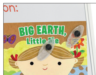
Magnetic Page Paws hold big book pages