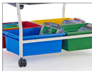
Slide out tubs with safety stops (tubs are made from recycled material)