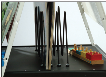
Big Book Rack is easily accessible