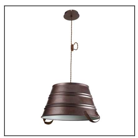
The photograph may not match the reference exactly. Please read the product description to identify the finish.