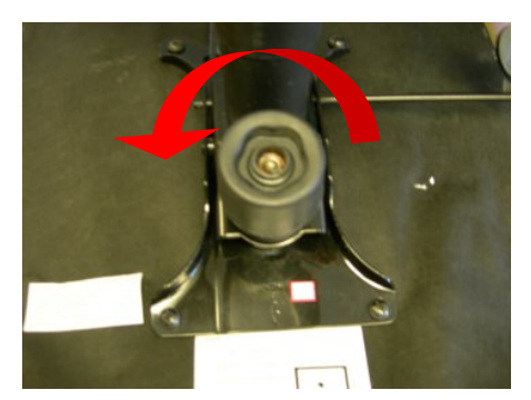
Anti Clockwise: decrease tension