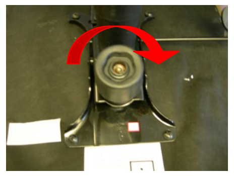
Clockwise: increase tension

• TENSION CONTROL : When the chair is in tilt mode, the tension can be adjusted to suit the weight preference of the user. Turn the handwheel clockwise to increase the tension and anticlockwise to decrease the tension.