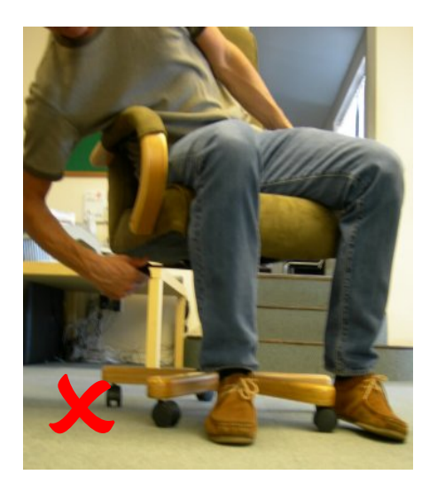
Do not lean heavily to one side