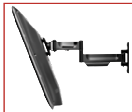
Swivel, tilt, extend or retract the display for the perfect viewing angle