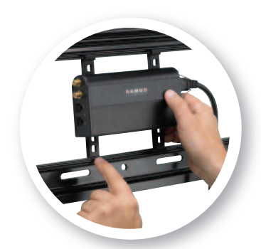
Attaches directly to mount with ClickFit™