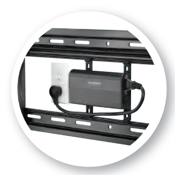
Use behind wall mounts and furniture