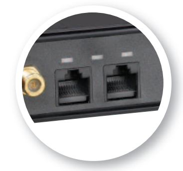
Combo Ethernet/phone jack