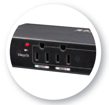
EMI/RFI filters eliminate noise