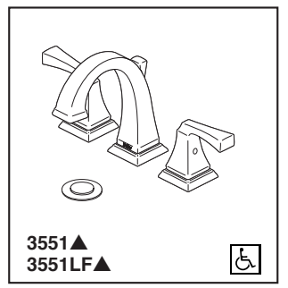
Submitted Model No.: