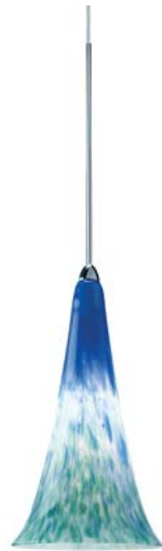
Shown with G614 Shade